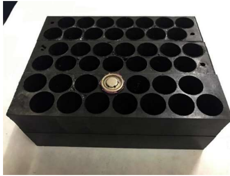
Fig.2 Form-stable PCM block

mechanical strength for impact resistance and is accommodating for your battery pack design giving superior performance even in high ambient temperature regions.